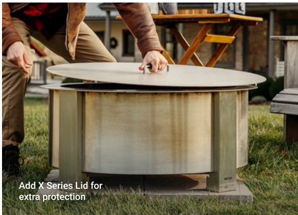
Add X Series Lid for extra protection