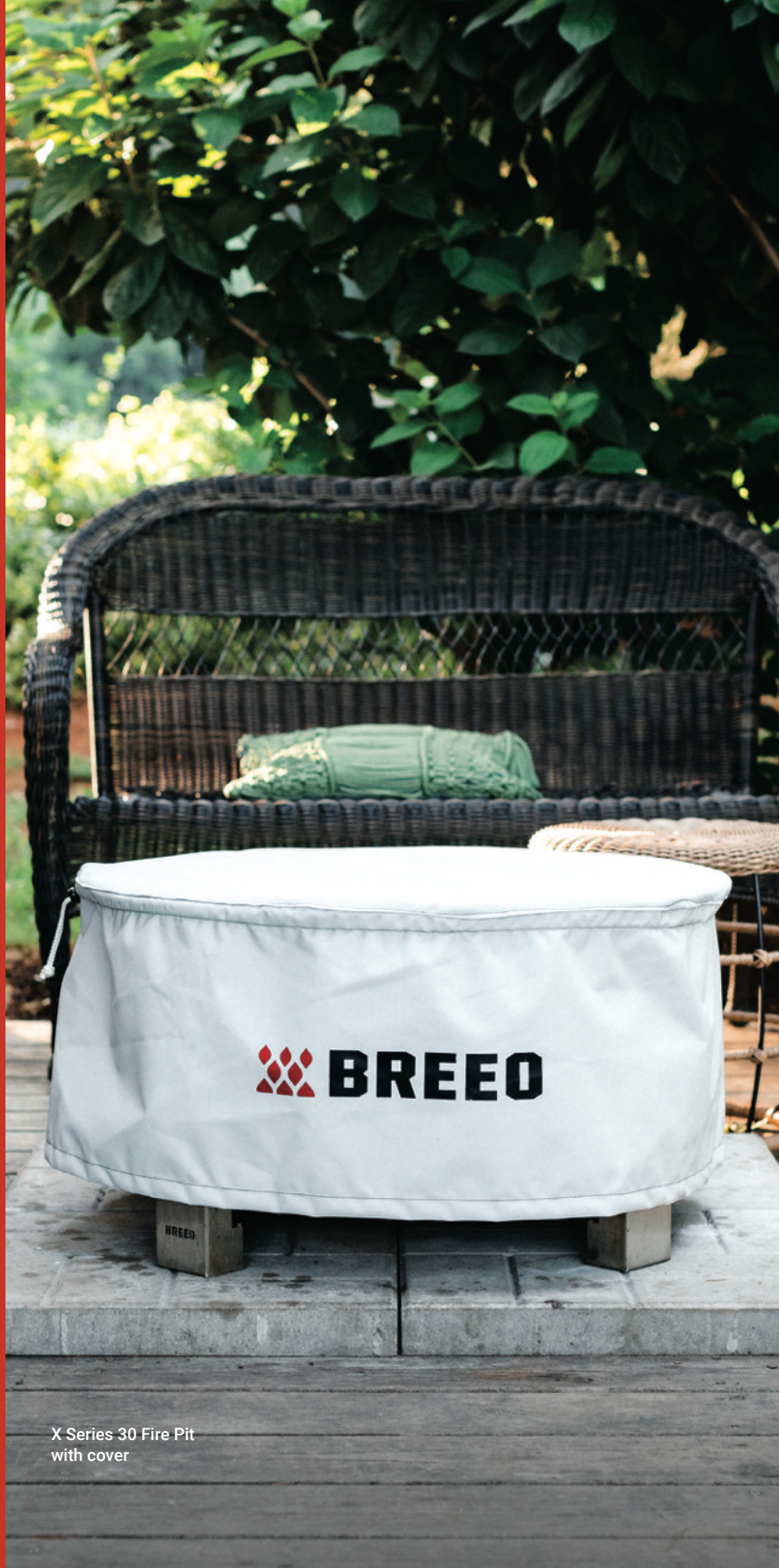
X Series 30 Fire Pit with cover

This fire pit cover is designed for outdoor use only.