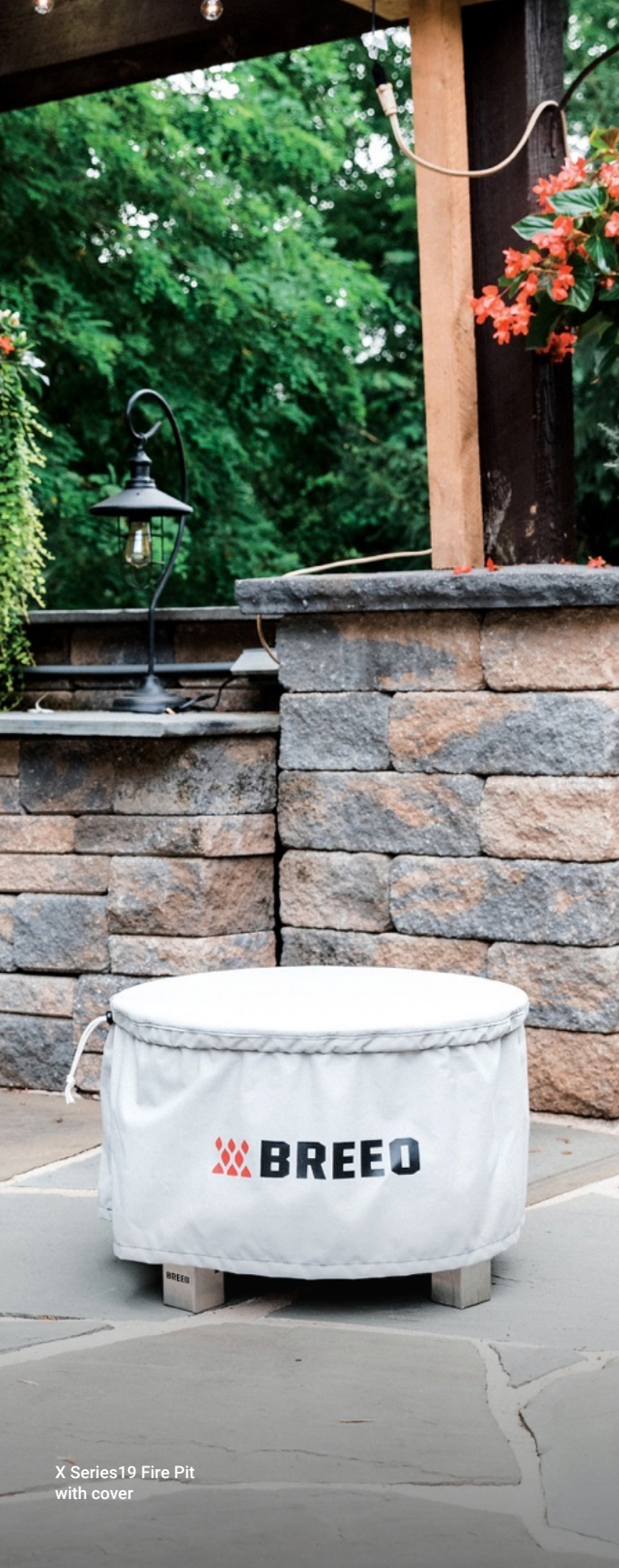
X Series19 Fire Pit with cover

Breoo, LLC warrants to the original purchaser that the Breoo Fire Pits and Accessories are free from workmanship and material defects during the lifetime of the original purchaser. In addition Breoo, LLC warrants no rust through or burn through for a period of five (5) years from purchase. If a product is covered by this limited warranty, Breoo, LLC, at its option, will repair or replace with a new product free of charge, excluding any applicable shipping and handling charges. If the product being warranted has been discontinued, the replacement product will be of equal or similar value. Altering any Breoo product, or using the product in any way other than the intended use, will void this Lifetime Warranty. Except as provided above, no warranty is offered on rust, paint or finishes due to being made with material with potential for corrosion. Steel products will develop a natural iron oxide patina over time.