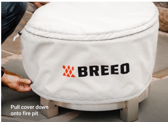
Pull cover down onto fire pit

Pull the drawstring cord tight around the bottom of the fire pit rim.